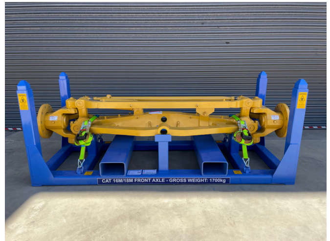
Before and after of a repaired 16M Front Axle